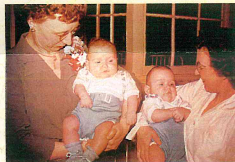
Twins in the nursery, 1950.