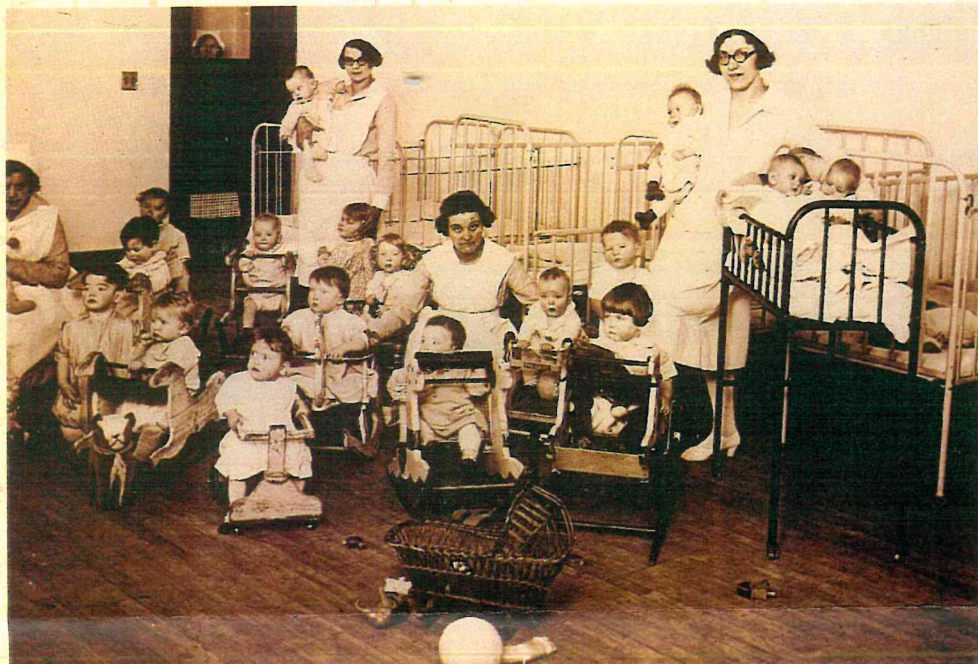
Child care workers with Kinderheim babies, circa: 1935.