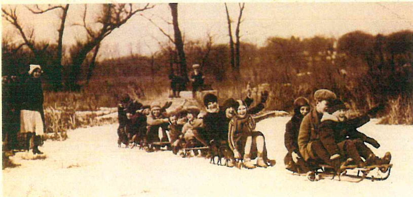
Children at the Kinderheim sledding, circa: 1935.