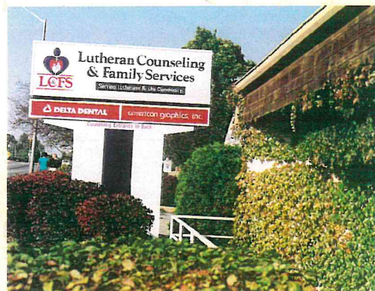
Administrative and counseling offices on Mayfair Road in Wauwatosa, circa: 1990.

The building on Mayfair Road presently serving as the administrative offices and the Milwaukee Area Office was purchased in 1990.